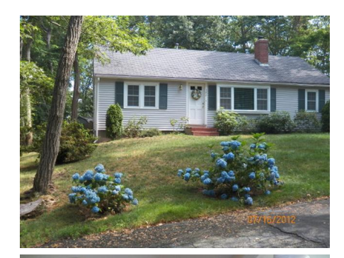
Key # 94 • Summer Weekly Rent: $2,200 • Minimum Weeks: 1